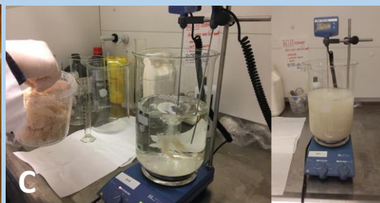
C: Pepsin digestion of rehydrated stockfish was used to assess the viability of nematodes.