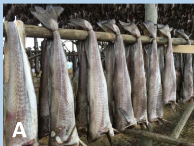
A: Traditional stockfish production